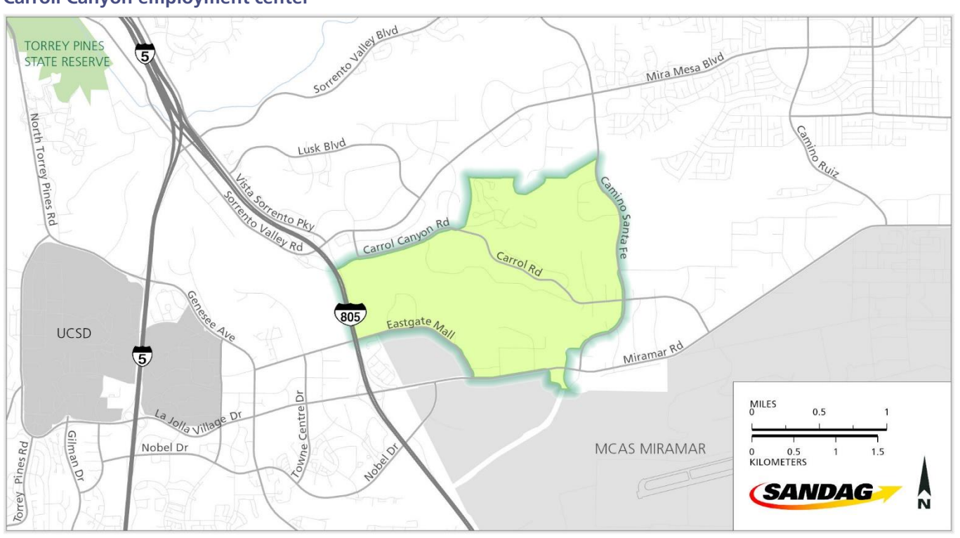
Map 1 Carroll Canyon employment center