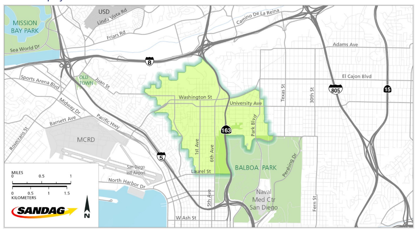
Map 1 Hillcrest employment center