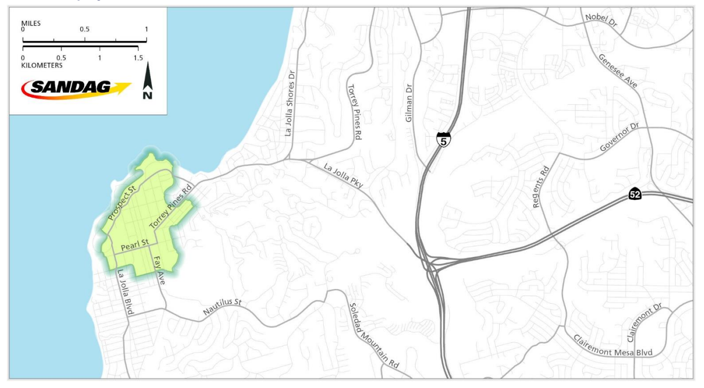
Map 1 La Jolla employment center