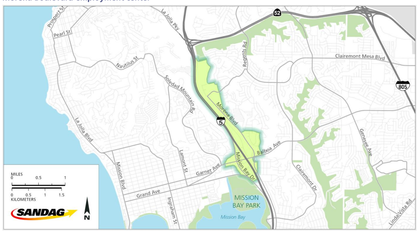
Map 1 Morena Boulevard employment center