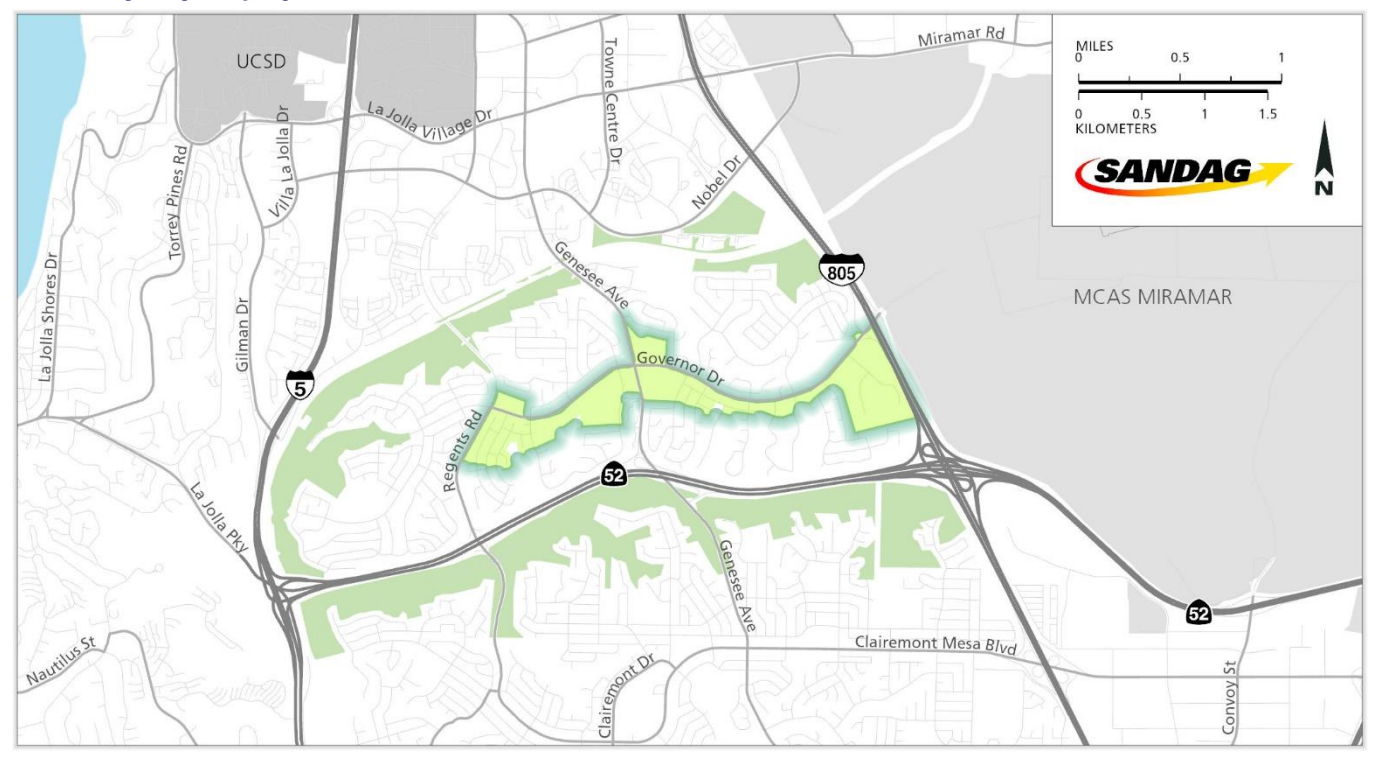
Map 1 University City employment center