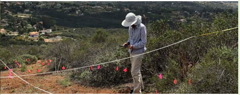
The annual monitoring of over 30 rare plant species continues with workshops held to train land managers and land owners on rare plant monitoring protocols. These surveys are used to create a monitoring baseline to track future changes these for species and prioritize management needs.