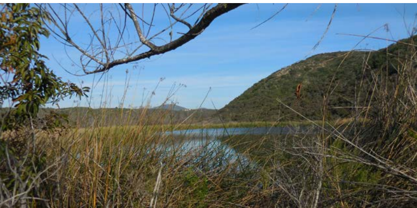
In June of 2018, SANDAG completed the acquisition of 111 acres of undeveloped land for preservation, with 12 acres of this restored as wetland for mitigation for regional transportation projects. The acquisition of Deer Canyon East is the last inholding needed to complete the City of San Diego's Del Mar Mesa Preserve.

Since its inception in 2008, the TransNet Environmental Mitigation Program (EMP) has played a vital role in habitat conservation, scientific research, and land management across San Diego County.