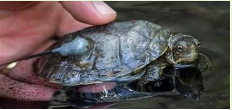
In 2018, photos of basking juvenile southwestern pond turtles were documented at Sycuan Peak Ecological Reserve. The U.S. Geological Survey has been removing invasive species at this location to promote the continued existence of these species with EMP funding.

EMP grants support land management activities, coordination, and collaboration across the region. Activities funded by the grants include but are not limited to invasive plant removal, trail restoration, protective fencing, habitat restoration, and monitoring of animals and plants.