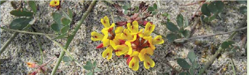
Invasive plants, which adversely affect the nesting sites for the California least tern and other rare plant species such as Nuttall's lotus, were removed by volunteers from the sand dunes at Mission Bay funded by an EMP grant to the San Diego Audubon.