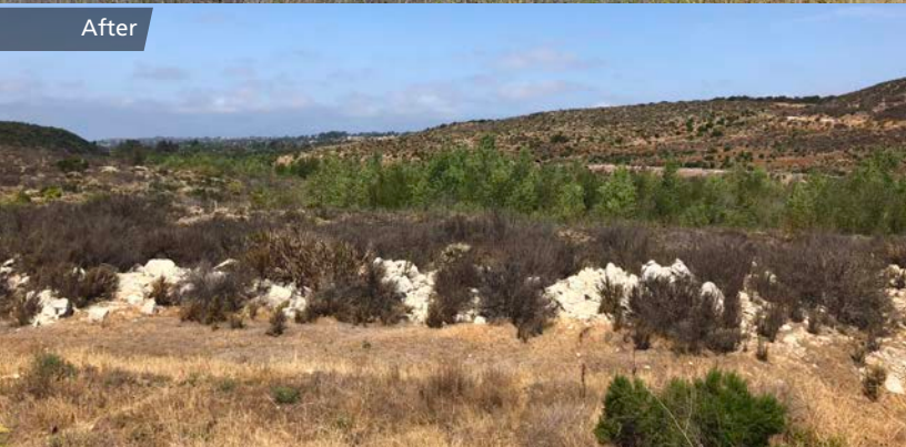
Historical agricultural fill was removed, invasive species controlled, and riparian and coastal sage scrub planted on the 31.4 acre Deer Canyon Wetland site to provide habitat for the federally endangered least Bell's vireo and coastal California gnatcatcher.