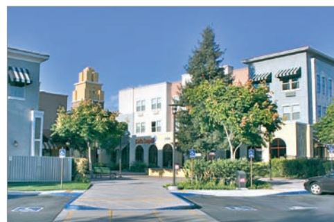
Curb ramps in Chula Vista provide access to sidewalks for all users.