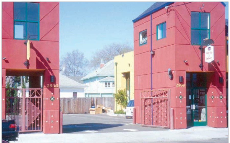
Shared parking conveniently located behind retail buildings in Berkeley, California, encourages people to link trips.