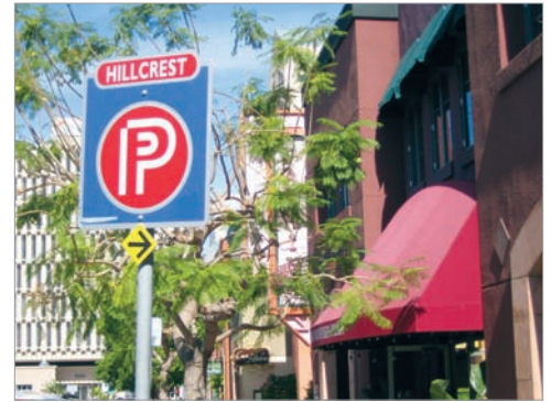
Signage in San Diego directs drivers to public shared parking lots.