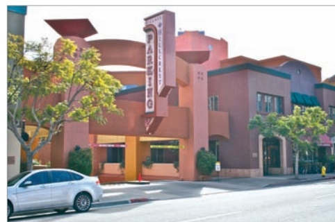
This garage in San Diego is wrapped by active uses at the street, and its architectural details are integrated with those of surrounding buildings.

See Also “Transformation of Existing Places” on page 20