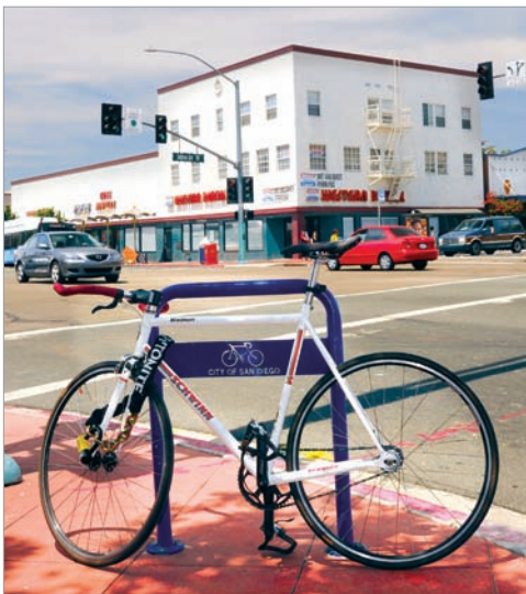
This rack in San Diego provides secure parking for bicycles.