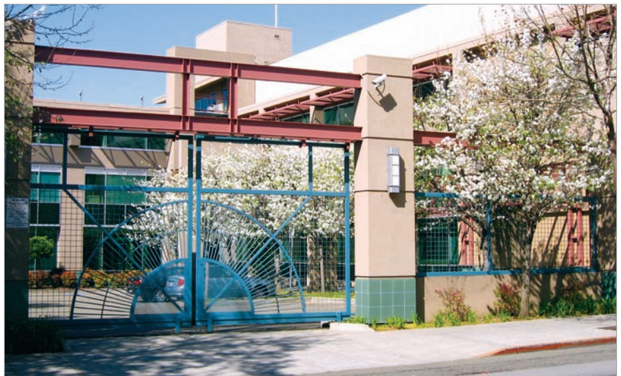
A decorative gate and fence screen a parking lot in Berkeley, California.