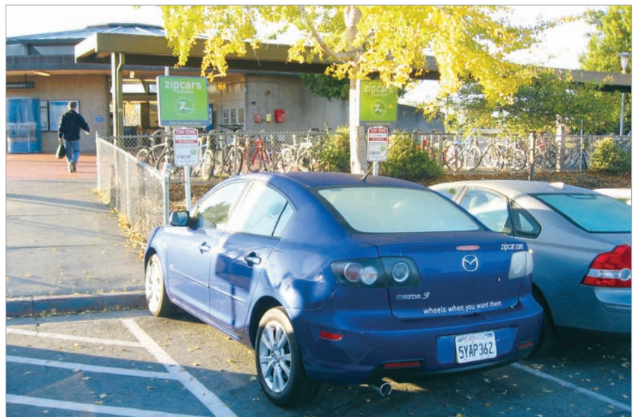
Car-sharing vehicles are located near the entrance to this transit station in Berkeley, California.