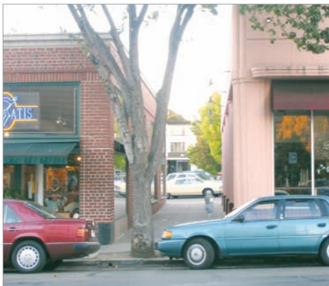
A pedestrian path leads to a shared parking lot behind these buildings in Oakland, California.