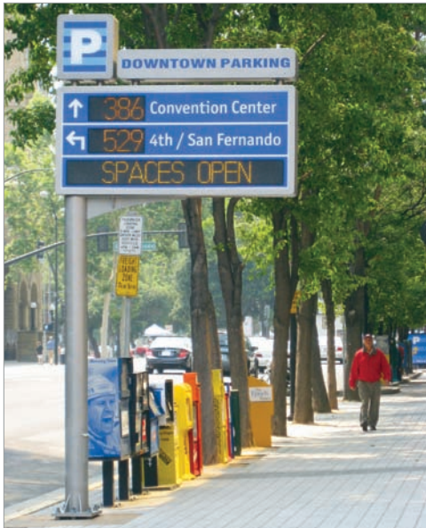
An on-street sign in San Jose, California, indicates where spaces are available at nearby parking garages.