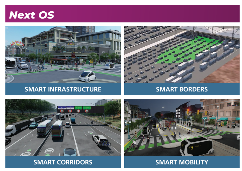
Next OS will focus on four smart system platforms that align with current regional project priorities including the State Route 11/Otay Mesa East Port of Entry Project.