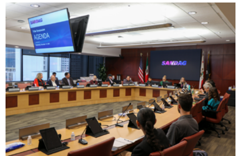
A joint meeting attended by members of the Borders Committee and Interagency Technical Working Group on Tribal Transportation Issues meet during the 2023 Tribal Symposium.

The SCTCA is a multi-service, nonprofit corporation established in 1972 by a consortium of 25 federally-recognized Indian tribes in Southern California. Its mission is to serve the health, welfare, safety, education, cultural, economic and employment needs of its tribal members and descendants in the San Diego County urban areas. As an intertribal council, the SCTCA serves as a forum for a wide variety of issues for tribal governments in the region.