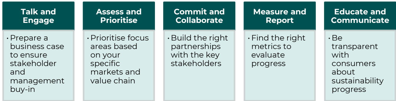
Figure 3: Sustainability Implementation Steps