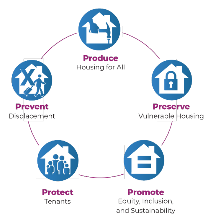
Figure 1: The 5Ps to Address the Root Causes of the Housing Crisis

The HAP Strategy describes SANDAG's role as a regional housing leader and the three core strategies to develop regional housing programs and policies. These core strategies were developed through a regional needs assessment by SANDAG that included interviews with local jurisdictions, best-practice research, and regional stakeholder focus groups to learn more about planning efforts and challenges affecting housing production across the region and what assistance is needed to overcome these challenges. The three core strategies include: