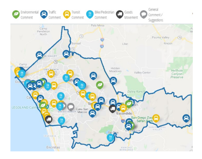
Figure 3: Public Survey Social Pinpoint Map

There were two main avenues for engaging the public. The public could engage via the virtual engagement hub. There were also two (2) virtual public meetings. Both these avenues were available in English and Spanish and provided an opportunity for all community members who live, work, or play in the North County subregion to provide input on the CMCP process. The virtual engagement hub included an online survey, interactive mapping, and comment input allowing community members and the general public to provide input into the development of the North County CMCP. The feedback obtained from these outreach efforts provided clearer direction for the North County CMCP, particularly with the values, goals, and mobility strategies and concurrence on the suite of transportation improvements that also met the needs and desires of North County communities.