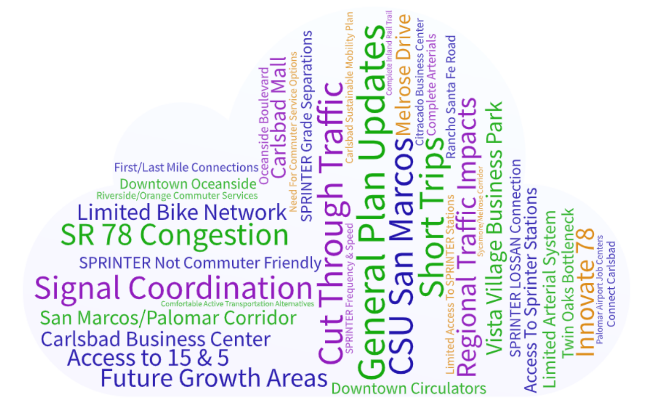
Figure 1: Word Cloud of City Staff Feedback

The North County CMCP effort was launched with a listening session tour through meetings with city managers, public works directors, and directors of planning and engineering across the North County study area. Key words and phrases from these meetings arose for challenges to existing travel within and between their cities, and opportunities for improving the transportation system at the sub-regional level to support multimodal trip making at all levels—including local community trips and regional trips.