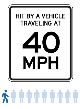
1 out of 10 pedestrians survive